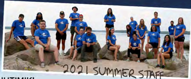
2021 SUMMER STAFF

While we are already booking rental groups in for the coming months, as of January 1st we will begin running our scheduled events for 2022! Check our website for more information on the Guys Getaway Weekend, WINTERIZED - Winter Camp and our Snowmobile Fundraiser!