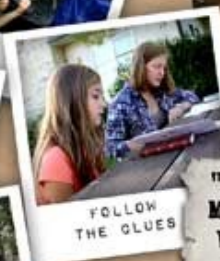
FOLLOW THE CLUES