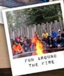
FUN AROUND THE FIRE